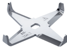
MI 250.2 Star-shaped cutter, stainless steel For fibrous materials such as paper and plant Ident. No. 0025003951