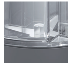
MultiDrive BL 2000 Vessel with cutter