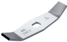
MI 250.1 Beater, stainless steel For hard, brittle materials up to Mohs hardness 5 Ident. No. 0025003993