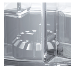
MultiDrive DI 2000 T Vessel with dispersing element