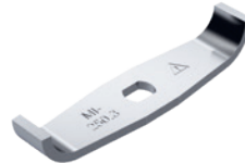
MI 250.3 Beater, hard metal For harder materials up to Mohs hardness 9 Ident. No. 0025003953