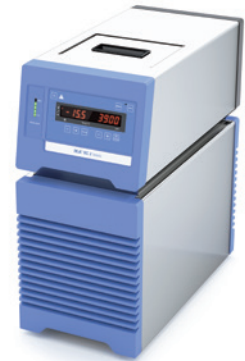
RC 2 basic Recirculating chiller Ident. No. 0004171000