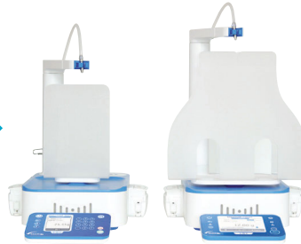
START EXPERT EVO w/ XL pack