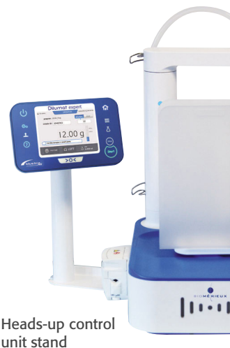
Heads-up control unit stand

Tune-up your Dilumat EXPERT EVO for large samples with the optional XL Pack